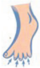
Liye lah oasr kihnet kuh olang ke niom