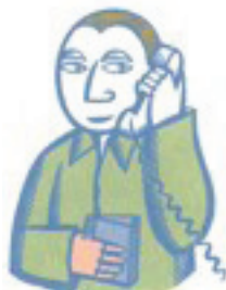
Pahngon taktuh lom ac a fahk elyah lom an