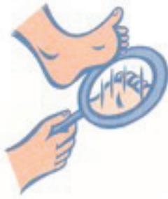
Lucng ac ten