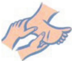
Siyuck kahsruh ac fin enenuh