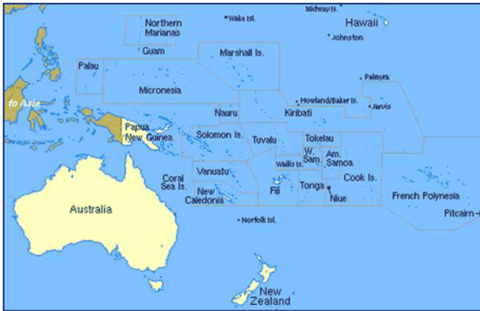
Figure 1. The US Associated Pacific Islands.

The USAPI annual per capita health care expenditure ranges from $140 in Chuuk to $1,032 in Guam; this stands in stark contrast to the annual US per capita expenditure of $5,711 (Table 1). Most islands depend on DDT funds to support their DPCPs. The average DDT funding award for the USAPI is $106,082, which covers administrative and staffing costs with modest support for community programs and outreach. Funding levels vary across jurisdictions depending on Congressional appropriations for the DDT competitive grant awards for DPCPs in the 50 states, territories, and island jurisdictions. Despite the persistent health care funding challenges amidst the growing epidemic of diabetes, the USAPI DPCPs have shown consistent capability and creativity in establishing partnerships across multiple sectors to leverage resources and broaden community outreach.